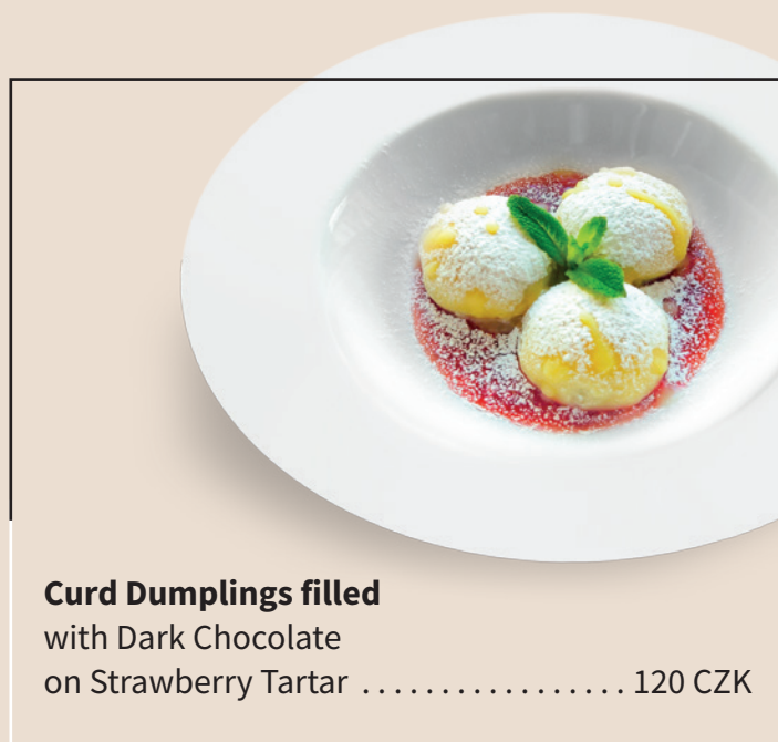
Curd Dumplings filled with Dark Chocolate on Strawberry Tartar . . . . . 120 CZK

Sorbets – Strawberry, Currant, Lime, Mango (price per scoop) . . . . . 35 CZK